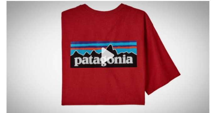
Video Ad Feedback