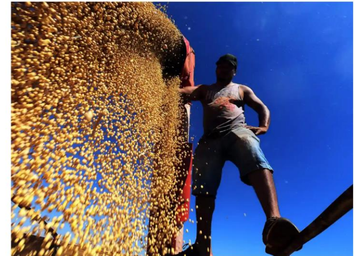
Soya beans are loaded on to a truck in Rio Grande do Sul, Brazil. The beans are a key ingredient in poultry, pig and cattle feed, and Brazil is among the world's biggest producers.

Cargill, Bunge and Cofco sourced beans from companies allegedly supplied by a farmer fined for destroying swathes of rainforest